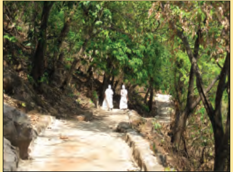
Shikharji darshan and yatra is an experience of a lifetime