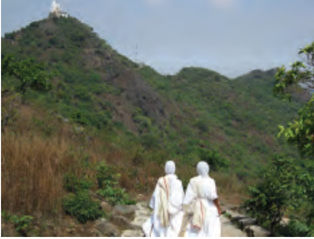
Two sadhvijis on yatra to Shri Parasnath Tonk. Shri Parasnath Tonk is at the highest spot at Shikharji. As it happens, the location of Shri Parasnath Tonk at Siddhachalam will also be at its highest spot.