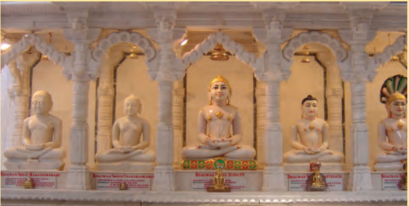
Picture of Main Temple at Siddhachalam Jain Tirth. Siddhachalam is an ashram and teerth for all Jains.