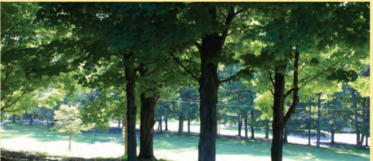
Siddhachalam is spread over 120-acres and comprises temples, library, congregation halls, cabins, dedicated residence for sadhus and sadhavijis, natural spring water ponds, nature and meditation trails. etc. It is uniquely placed to replicate Shikharji darshan and yatra experience. Join us on August 28-29, 2010