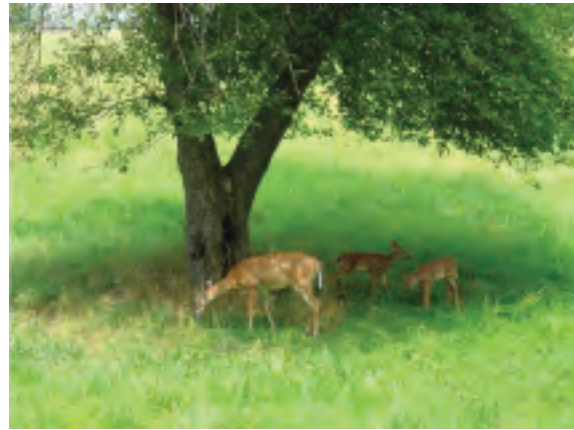
Deer and other animal life are protected at Siddhachalam. Each year, Siddhachalam distributes nearly 25,000 pounds of corn for deer and other animals during winters.

Siddhachalam Jain Tirth, the world’s first teerth outside India, has embarked on complete, scaled, replication of Shikharji’s Tonks, Jal Mandir and Bhomiyaji temple.