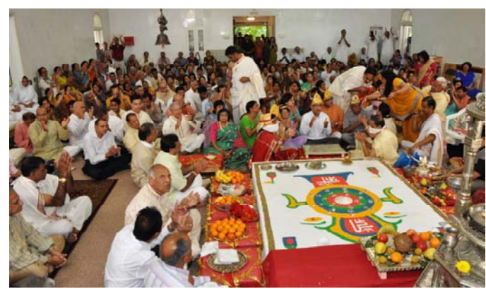
Shikharji Mahapujan of the 30 Tonks (above) was followed by Bhoomi Pujan (below).