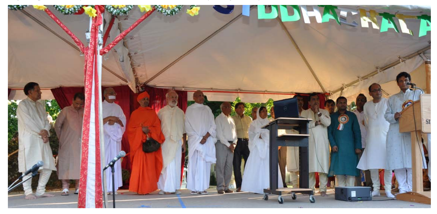
Bhoomi pujan process being explained in the presence of Maharaj Sahabs prior to assignment of Tonks. All donors for bhoomi pujan or khanan had the right to perform it. Tonks were selected by a computerized random draw. Draw was held on the eve of Bhoomi Pujan & Khanan in the presence of Maharaj Sahebs and with their blessings.